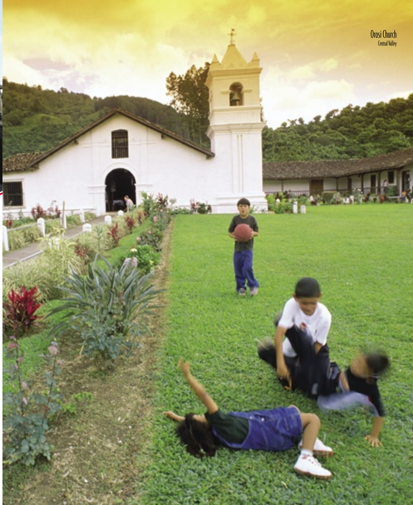
Orosi Church Central Valley

The imposing Gothic architecture of the National Theater stands out and is nestled in the heart of the city. Throughout the years, the Theatre has put on several performances of every genre. The Gold Museum has a display of the Pre-Columbian art that formerly existed in the country. At the National Museum you can travel through Costa Rica's history, and the Children's Museum will lead you through an interactive learning adventure for the whole family, using innovative devices through which visitors can learn and play.