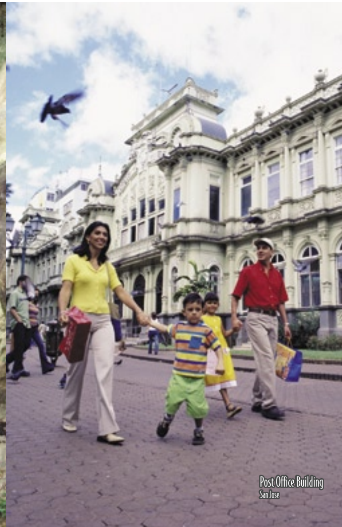
Post Office Building San Jose