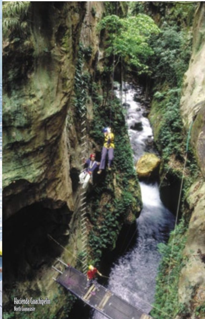
Hacienda Guachipelin North Guanacaste