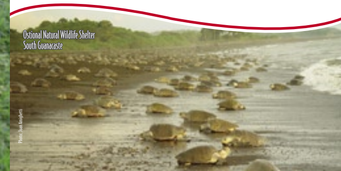
Ostional Natural Wildlife Shelter South Guanacaste

The combination of forest and beaches offers a singular scenic beauty, of a landscape with great diversity, bathed by the Caribbean Sea and the Pacific Ocean.